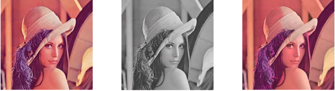
Figure 2: Colorization. From left to right: original image, image when 99% of the color was removed and restored image.

In Figure 2 we see an example of colorization applied to an image known among the image processing community as Lena. We assume that we know the brightness but the color of every pixel is only known with probability 0.01. We first detect the edges from the grayscale-image using a canny-edge detector. We then compute the color part by minimizing a weighted (according to the edges) TV-functional with small \lambda . We were not able to get a comparable result using the proximal point algorithm.