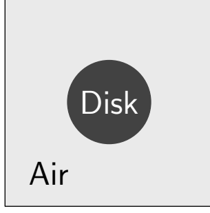
Figure 2: Unit cell of the benchmark setup